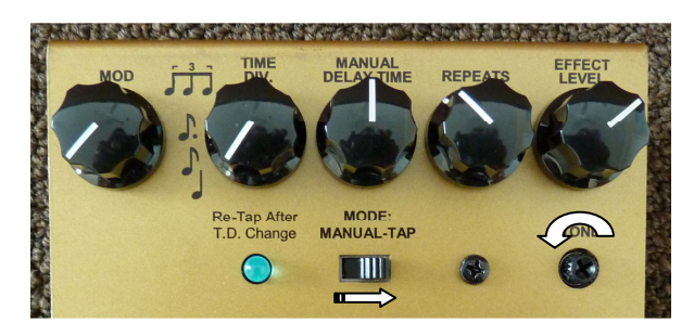
Rolled Off Tap Delay