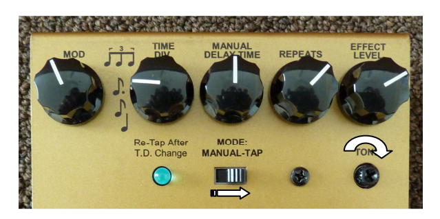
MOD TO TIME DIV. MANUAL DELAY TIME REPEATS EFFECT LEVEL Re-Tap After T.D. Change MANUAL-TAP

There are an endless variety of settings to experiment with and use with the Visual Sound Tap Delay. Here are just a few to get you started. As you will soon find out, there is really not a bad setting to be found with this pedal. Enjoy!